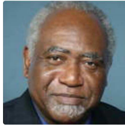
Congressman Danny K. Davis 7th District of Illinois